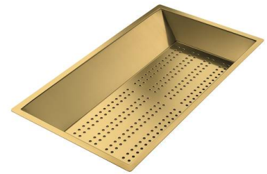
Stainless steel perforated tray PVD Gold 8151 009