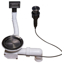
Space Push Gun Metal automatic waste fitting - PO