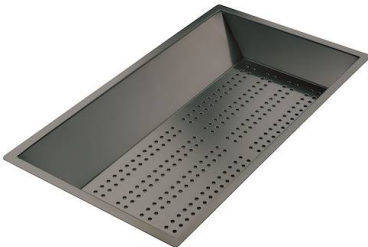
Stainless steel perforated tray PVD Gun Metal 8151 006