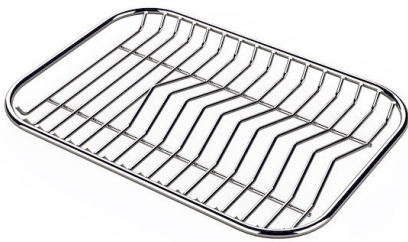
Stainless steel plate rack only usable in combination with the accessories 8644 003 8100 154